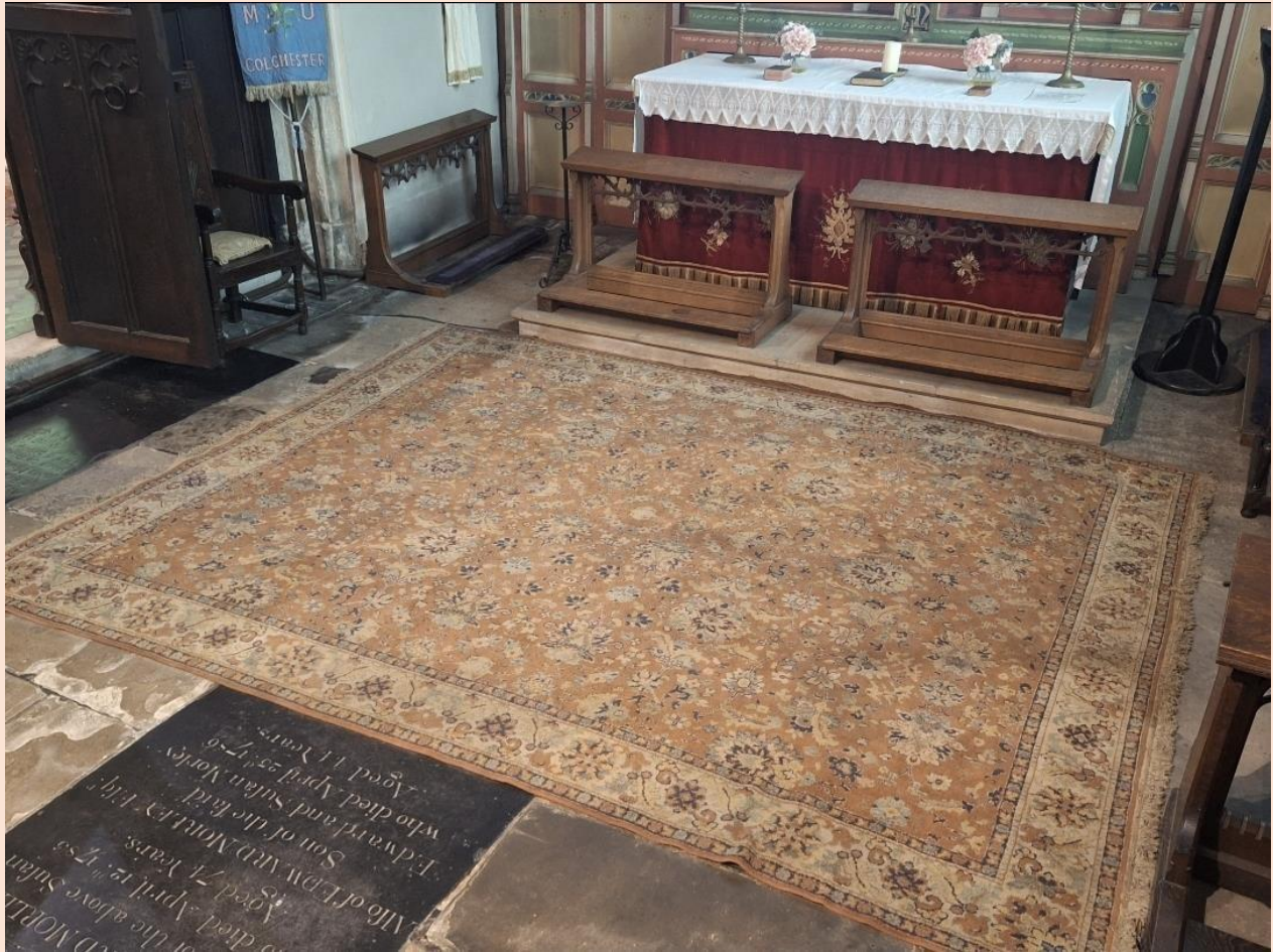
The Lady Chapel carpet.