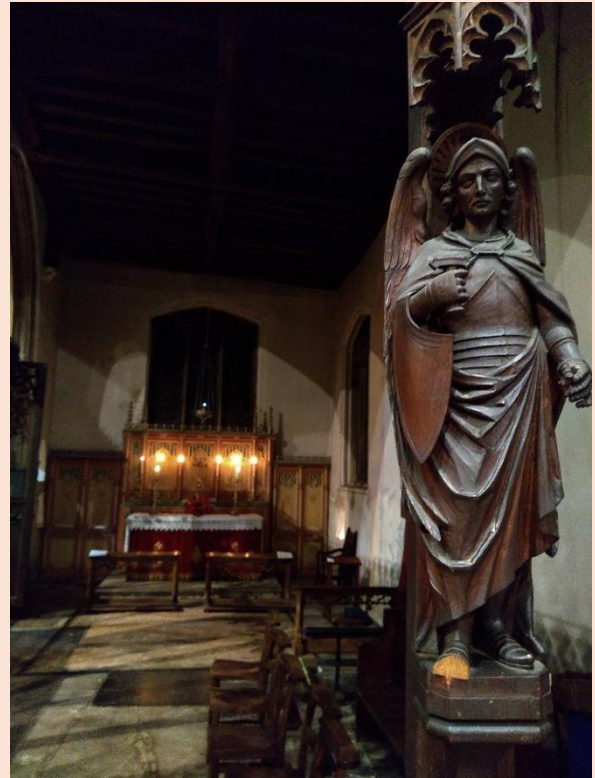
CCT's image of St Michael.

A recent rummage in a drawer at the back of the church found two nicely carved items that no one had, until then, connected back to Archangel Michael. How many years they had been separated in anyone's guess but suffice to say that sword and toes are now back where they belong.