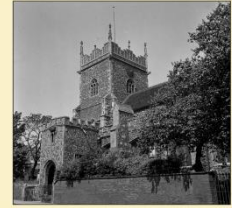
THE MEDIEVAL CHURCH OF ST LEONARD-AT-THE-HYTHE

The book continues to sell well, so don't delay if you've yet to secure your copy – discounted to just £10 if bought direct from the church.