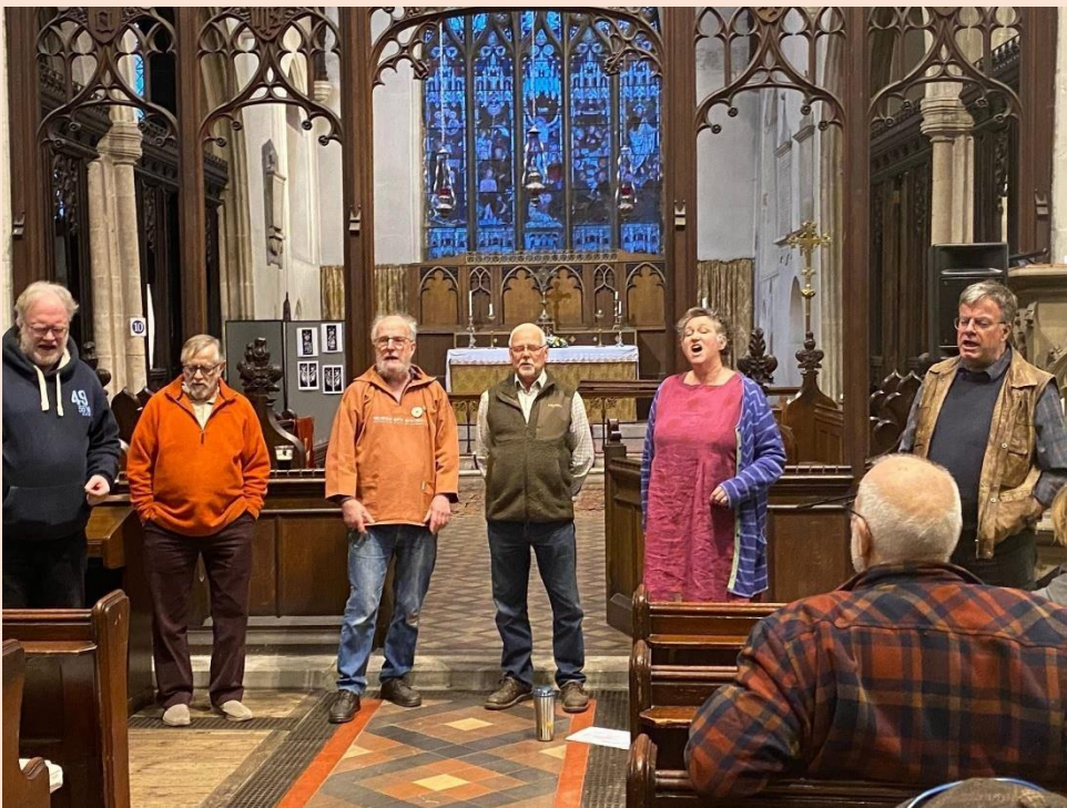
Capstan Full Strength