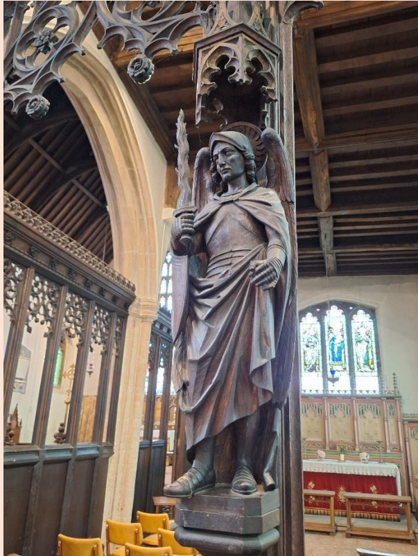
Sword and toes reunited.