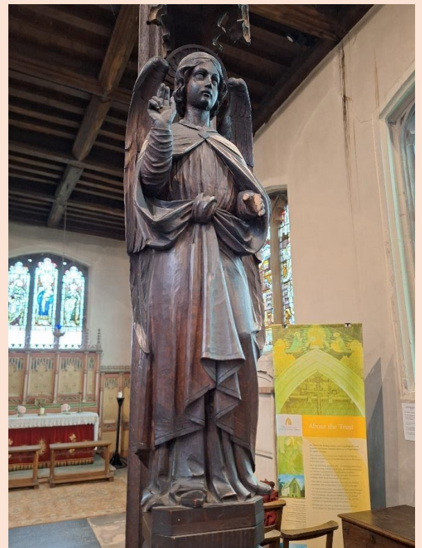
Now we just need to find Archangel Gabriel's missing fingers!