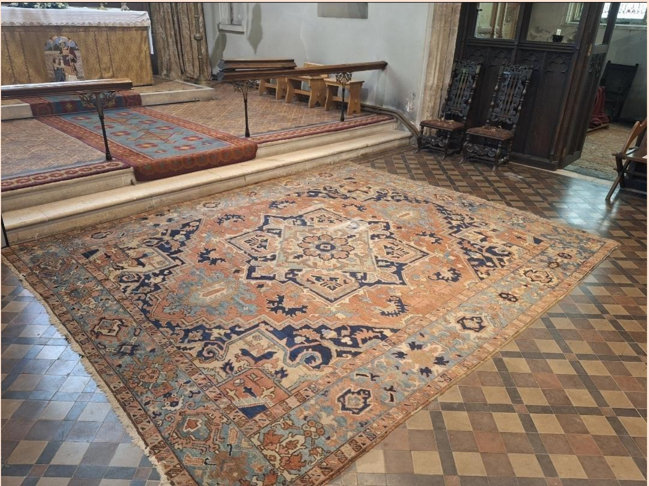
The Chancel carpet.

Now that we know this, the advice is that both carpets should be inspected accurately to assess restoration requirements. We have made The Churches Conservation Trust aware and await their further advice on where we go from here.